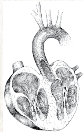
...essential for a healthy heart?